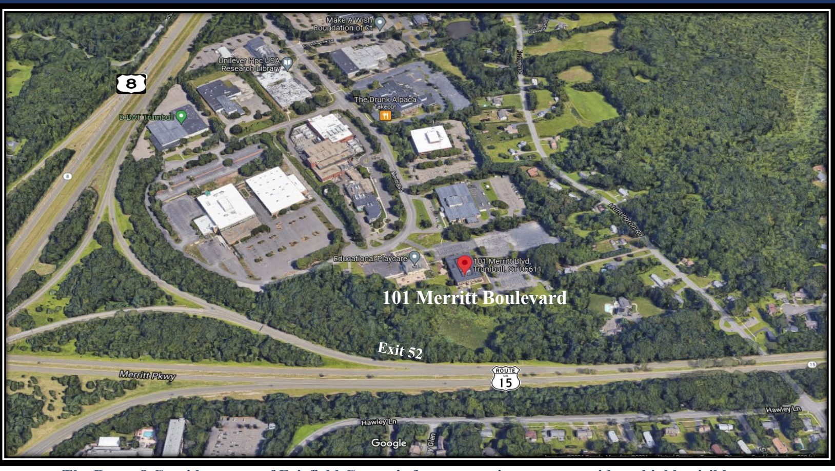
The Route 8 Corridor—one of Fairfield County's fastest-growing areas provides a highly visible campus setting that is commuter-friendly.