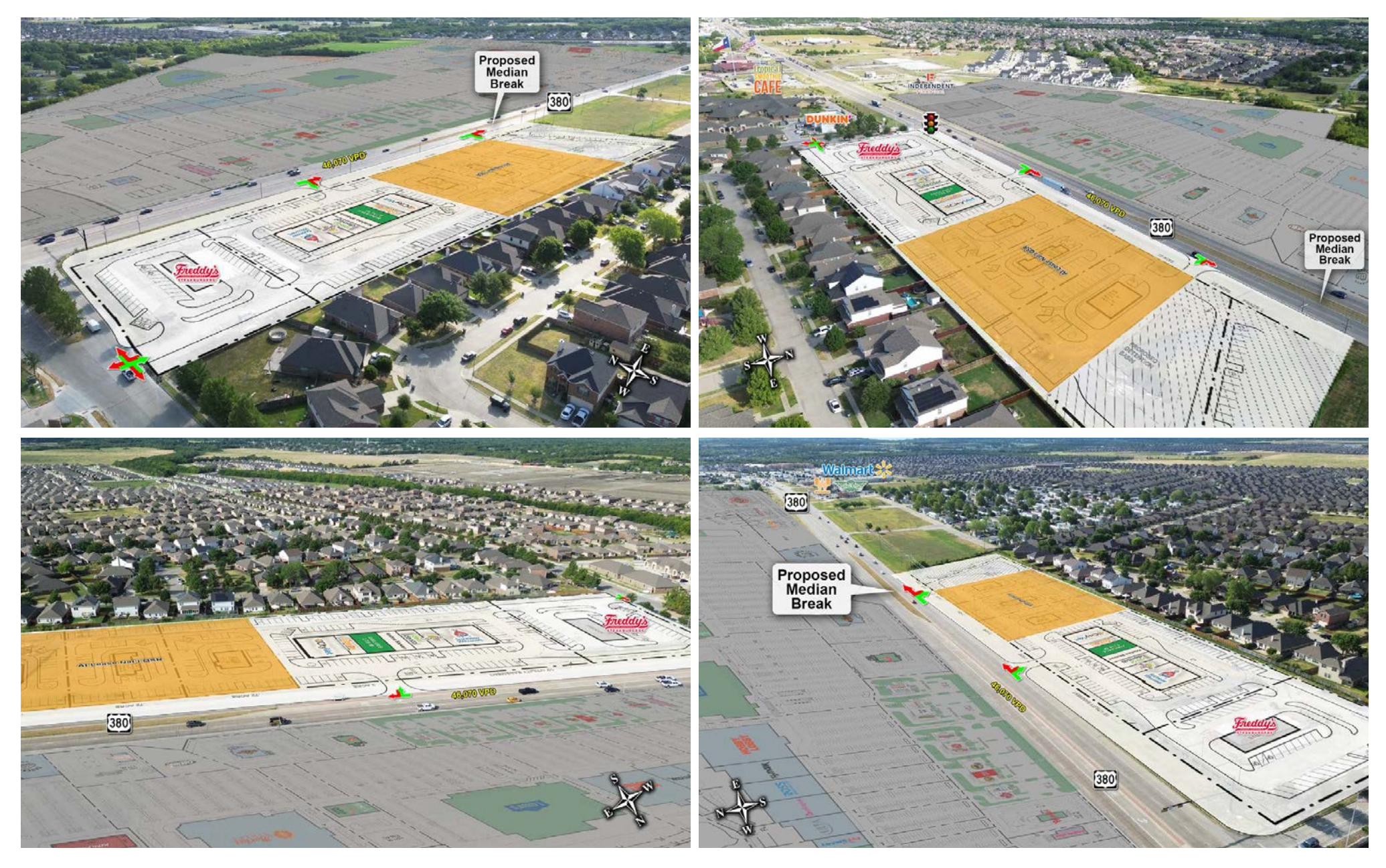
The information contained herein was obtained from sources deemed reliable; however, RESOLUT RE makes no guaranties, warranties or representations to the completeness or accuracy thereof. The presentation of this real estate information is subject to errors; omissions; change of price; prior sale or lease; or withdrawal without notice. RESOLUT RE, which provides real estate brokerage services, is a division of Reliance Retail, LLC, a Texas Limited Liability Company.