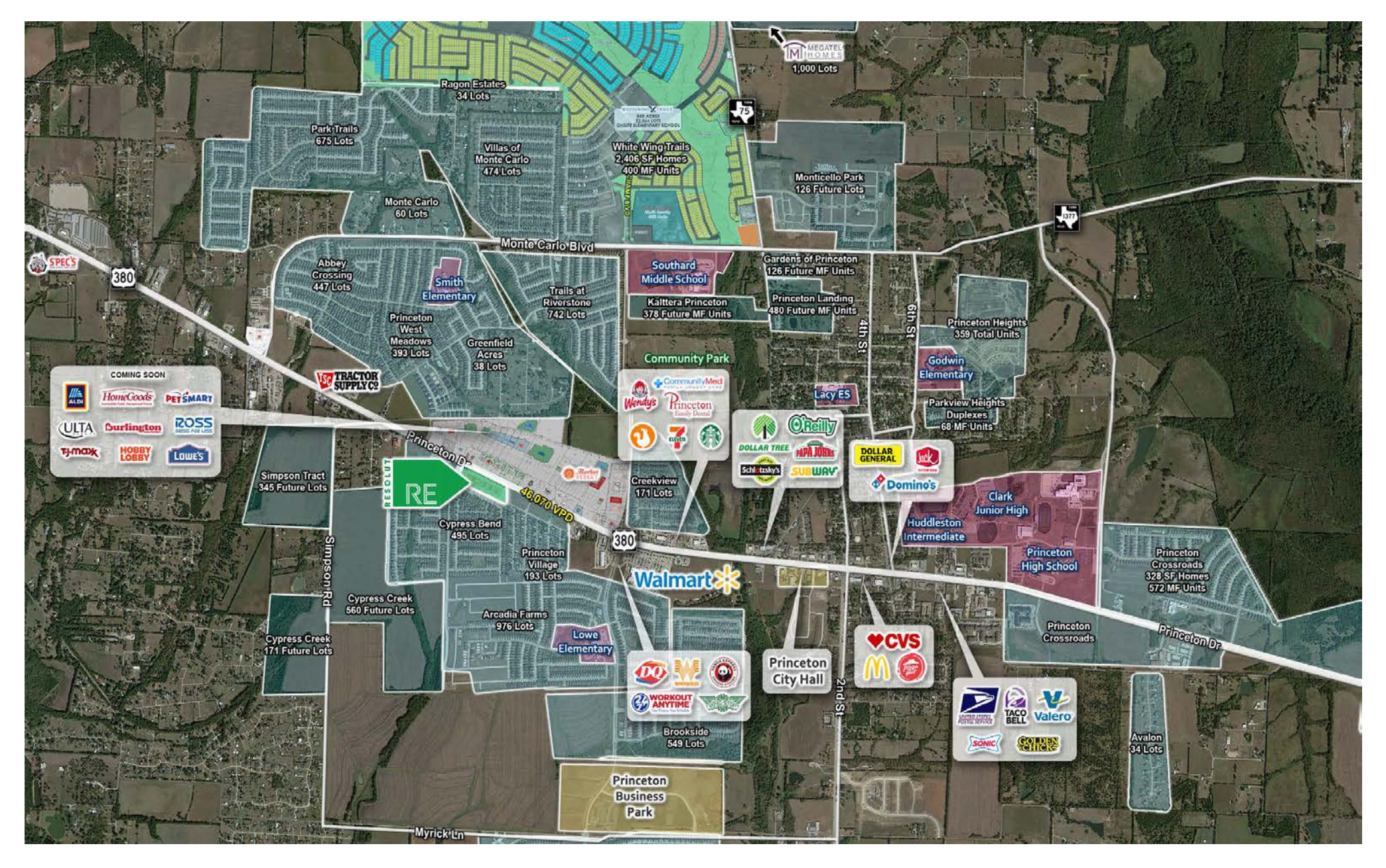
The information contained herein was obtained from sources deemed reliable; however, RESOLUT RE makes no guaranties, warranties or representations to the completeness or accuracy thereof. The presentation of this real estate information is subject to errors; omissions; change of price; prior sale or lease; or withdrawal without notice. RESOLUT RE, which provides real estate brokerage services, is a division of Reliance Retail, LLC, a Texas Limited Liability Company.