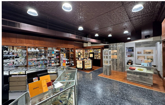
Ground Floor: 1,897 SF+/- . Ceiling: 14'8" Ceiling may be raised approx. 16" further Private elevator & dumbwaiter all levels.