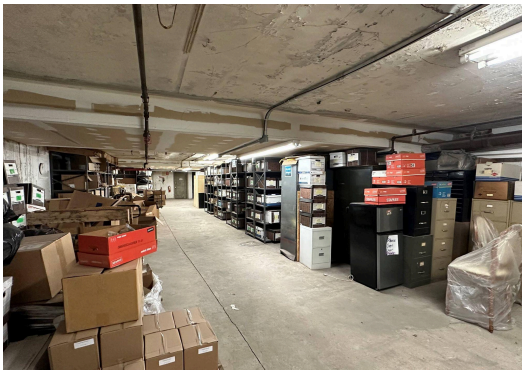
Sub-Cellar: 2,170 SF+/- . Ceiling*: 8'1" Finished space. Rear yard access. *(7'0" under joist enclosures)