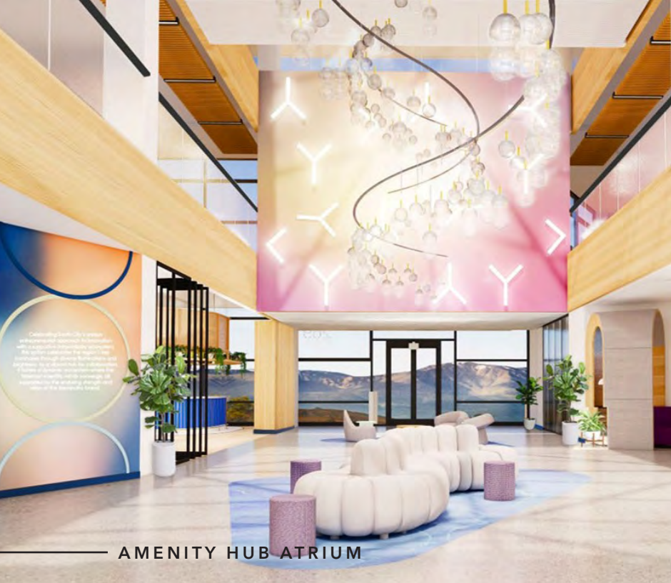
AMENITY HUB ATRIUM