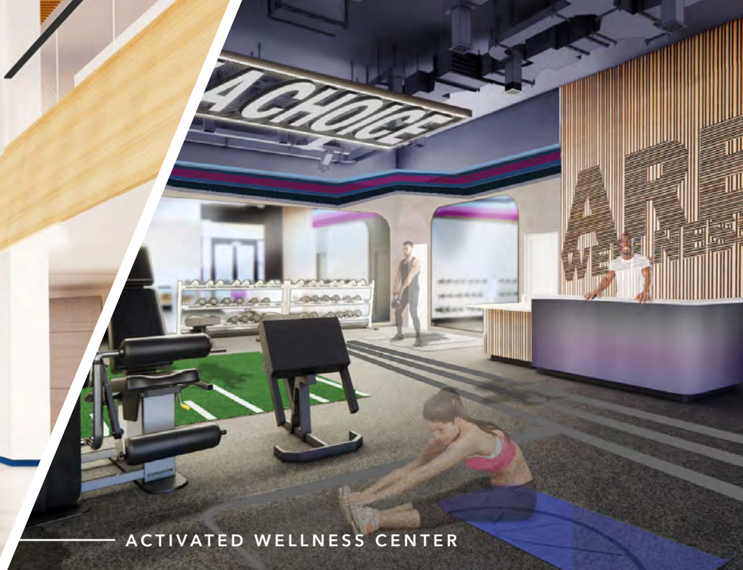
ACTIVATED WELLNESS CENTER