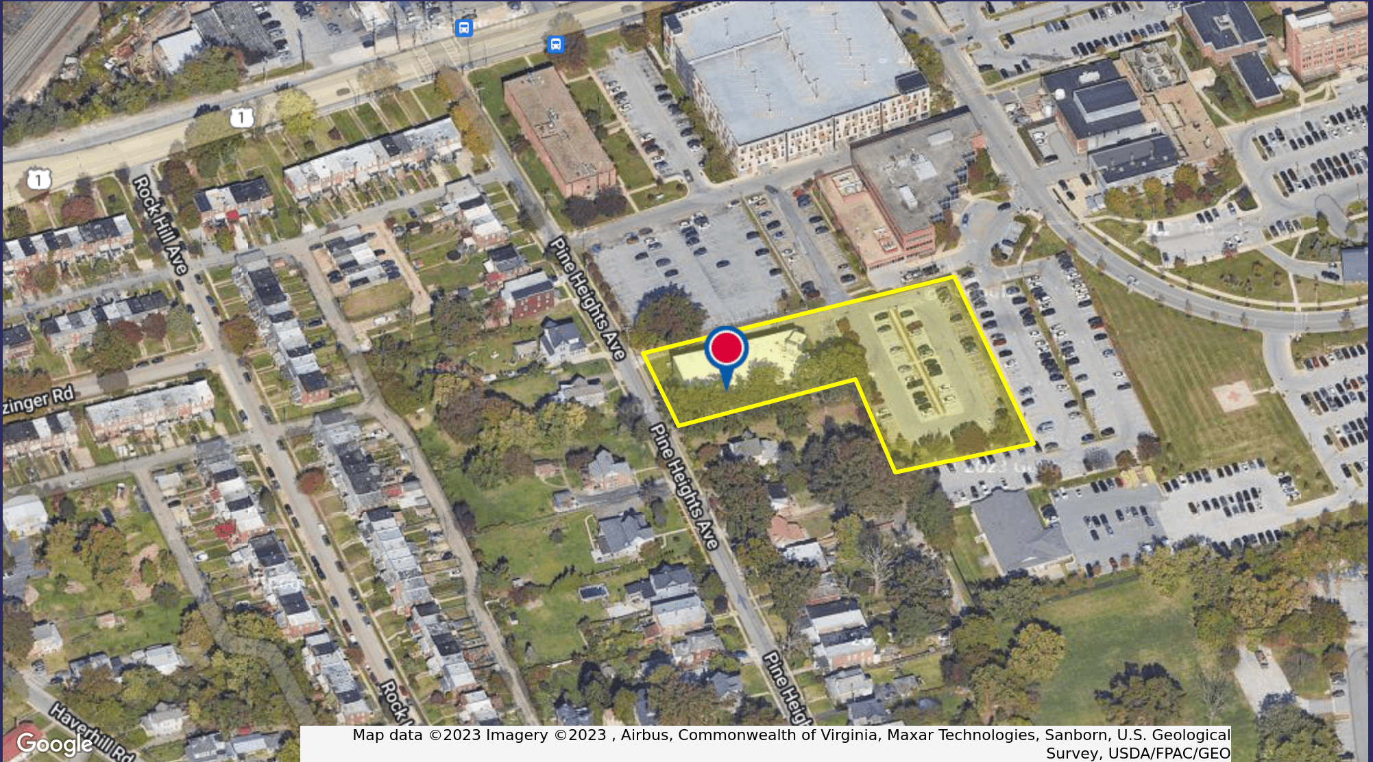
Map data ©2023 Imagery ©2023 , Airbus, Commonwealth of Virginia, Maxar Technologies, Sanborn, U.S. Geological Survey, USDA/FPAC/GEO