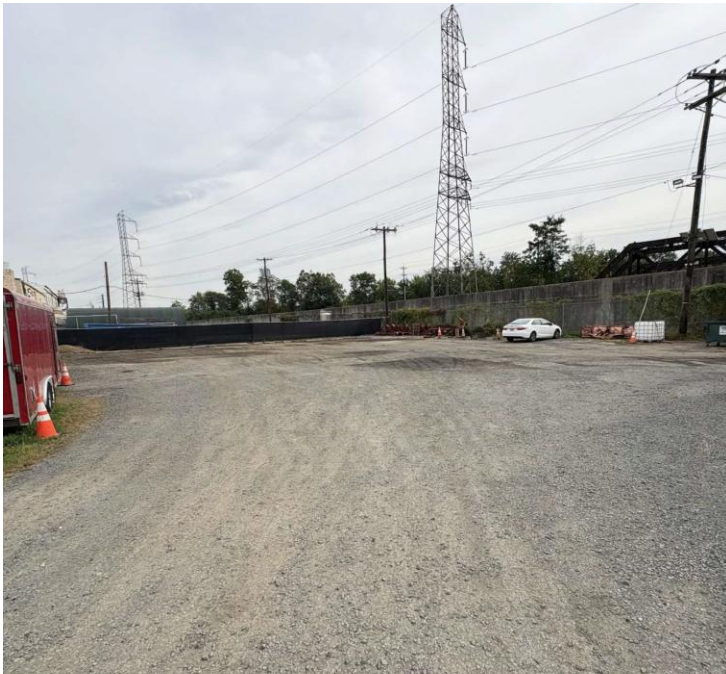
Outside Storage 1

Outside storage of approximately 15,000+/- sq. ft. available. Outside storage is fenced and lit.