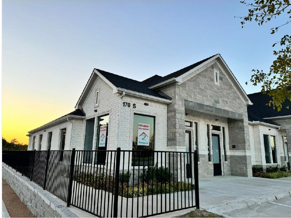
End Cap Unit