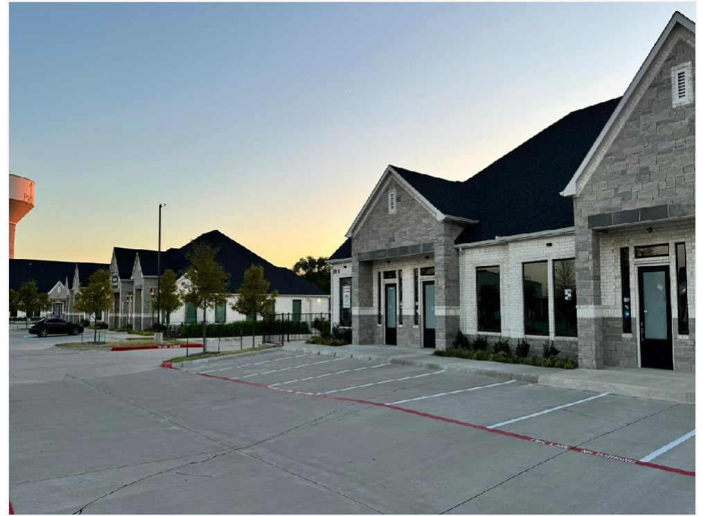
Parking on other side as well