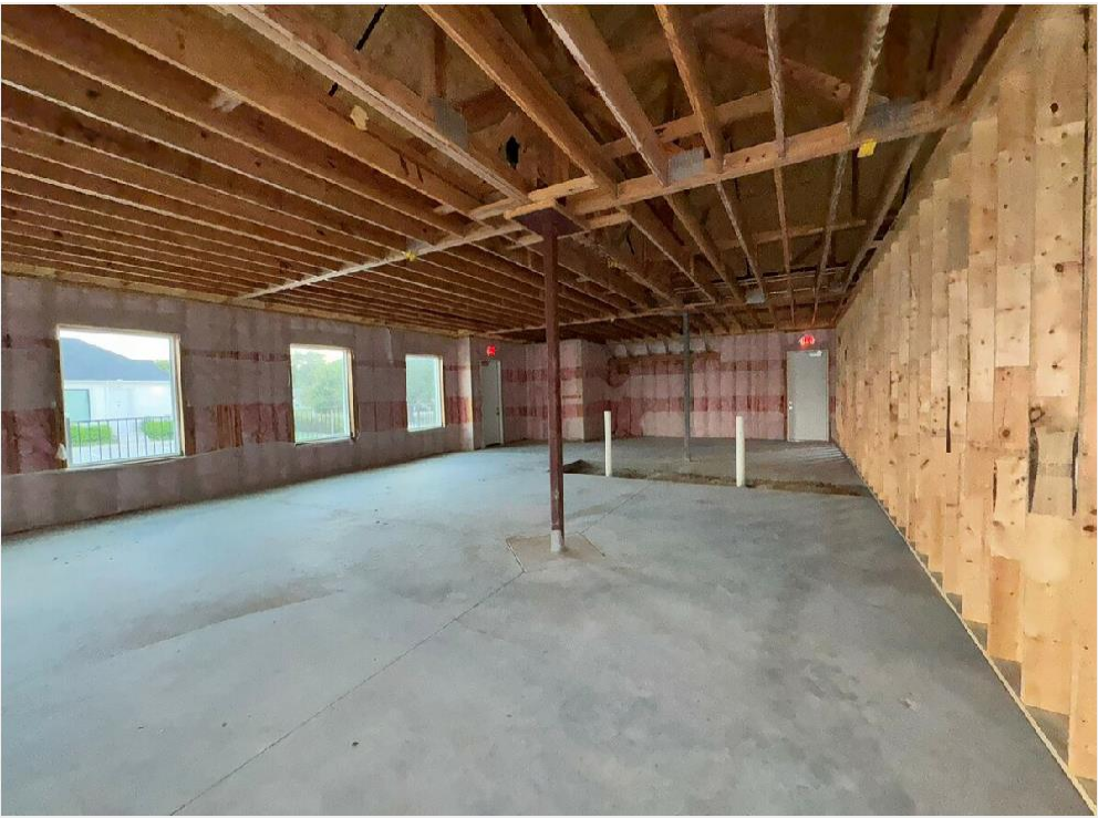
Interior - Shell Condition