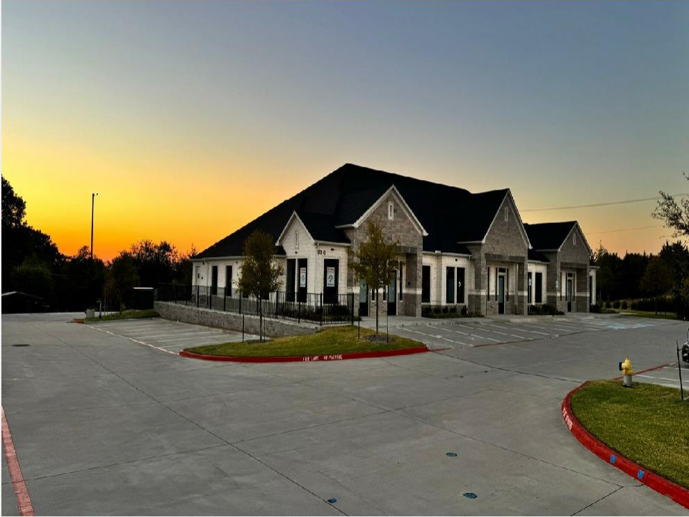
Your future business location