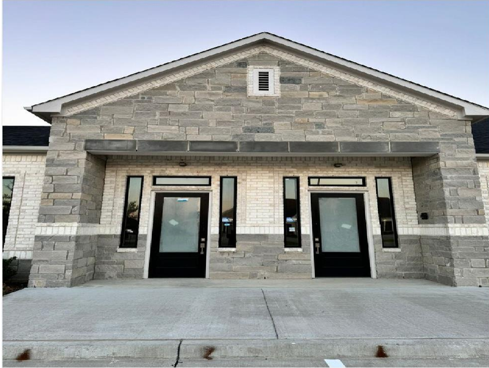
Two doors - large signage