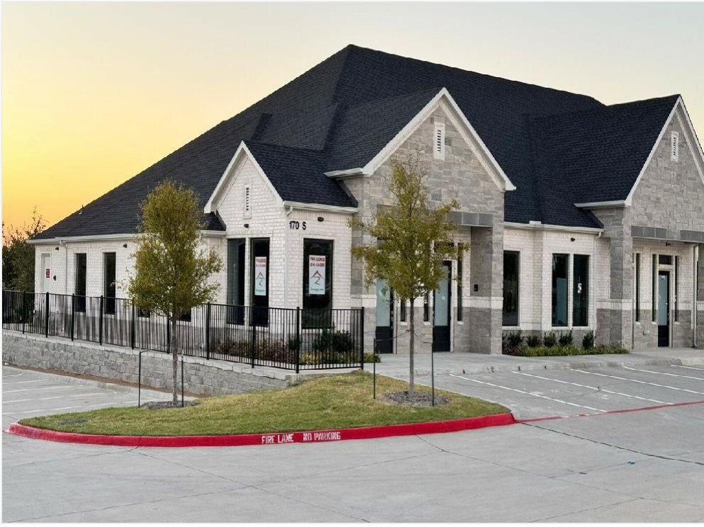
Ample Parking 2