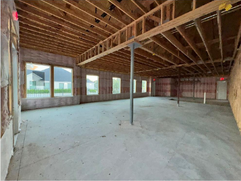
Interior - Shell Condition