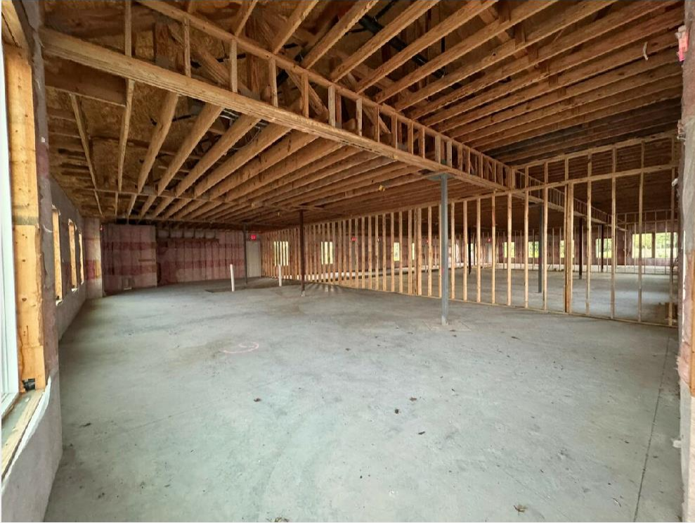
Interior - Shell Condition