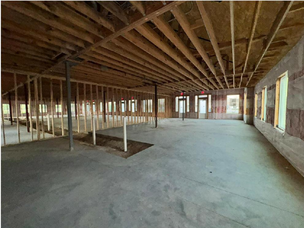
Interior - Shell Condition