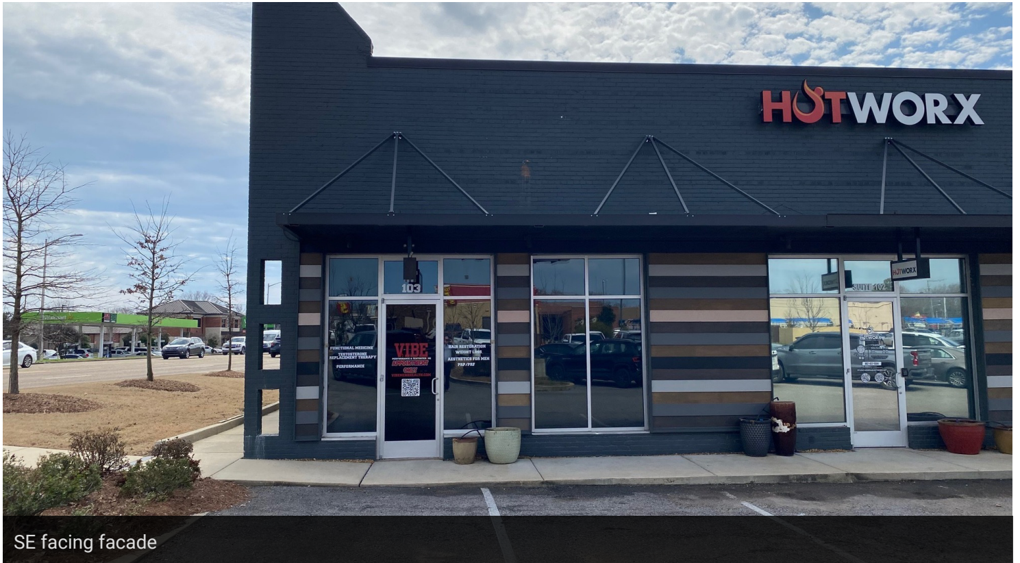
SE facing facade