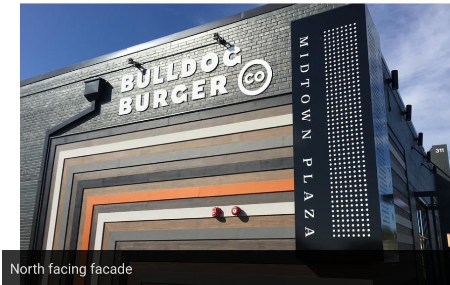
North facing facade