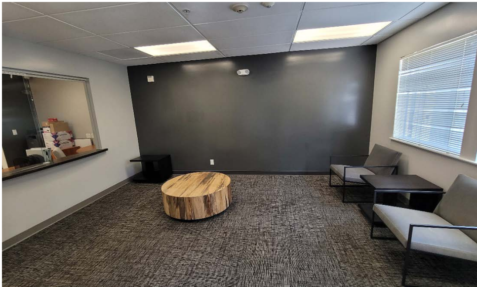
Furniture, Fixtures & Equipment