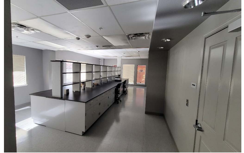
Counters, cabinets and shelving