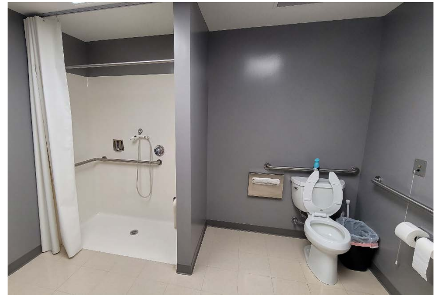
ADA restrooms with showers