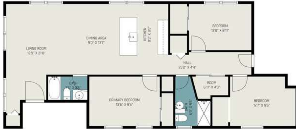
1109 SF Multifamily Unit

john greene Commercial | 1311 S Route 59, Naperville, IL 60564 | 630.229.2290