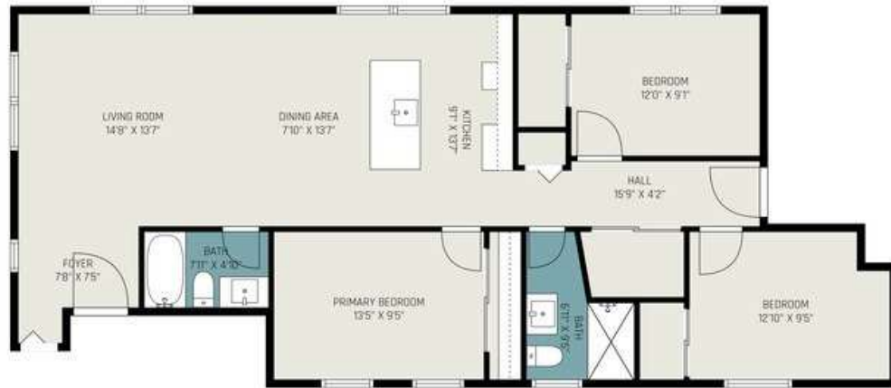
1109 SF Multifamily Unit