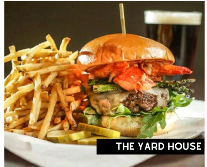
THE YARD HOUSE