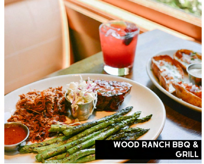
WOOD RANCH BBQ & GRILL