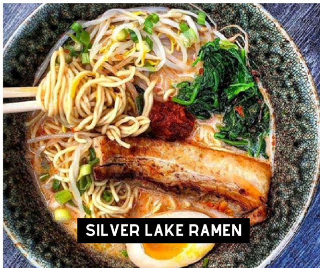
SILVER LAKE RAMEN