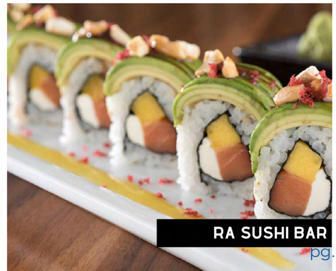
RA SUSHI BAR