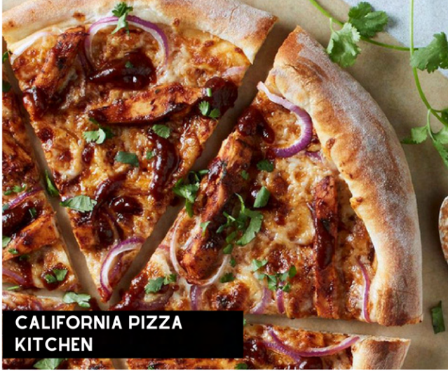
CALIFORNIA PIZZA KITCHEN