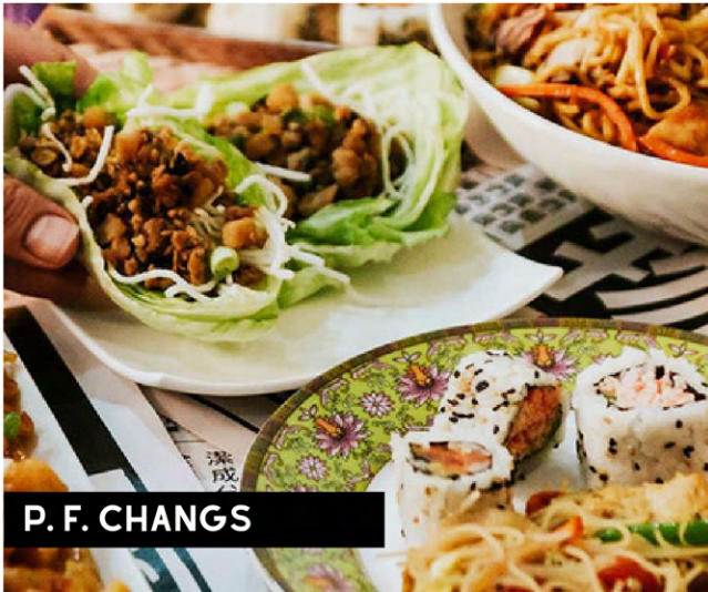
P. F. CHANGS