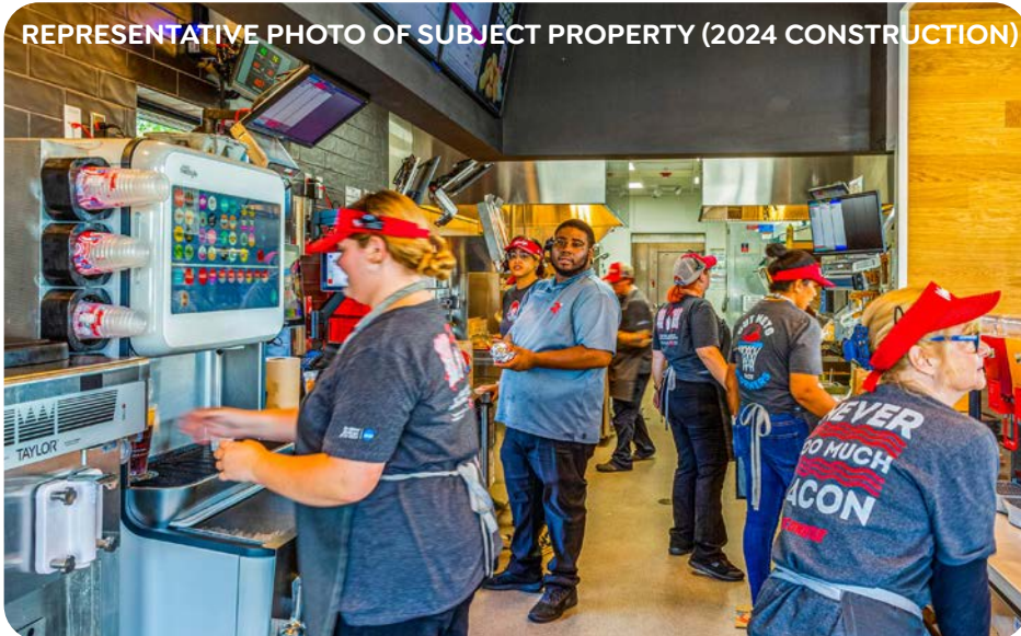
REPRESENTATIVE PHOTO OF SUBJECT PROPERTY (2024 CONSTRUCTION)