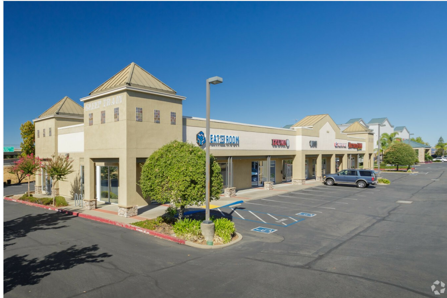
Freeway visibility and Signage

6840-6848 Five Star Blvd, Rocklin, CA 95677