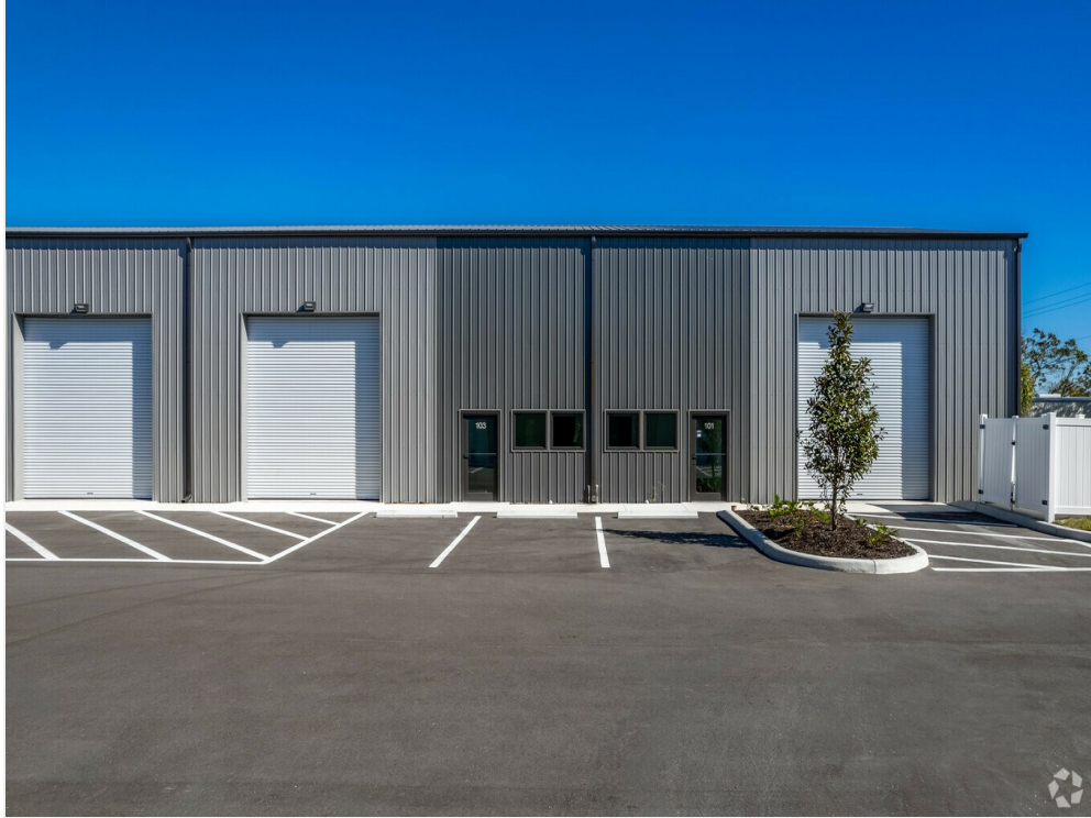
Suites & Loading Docks