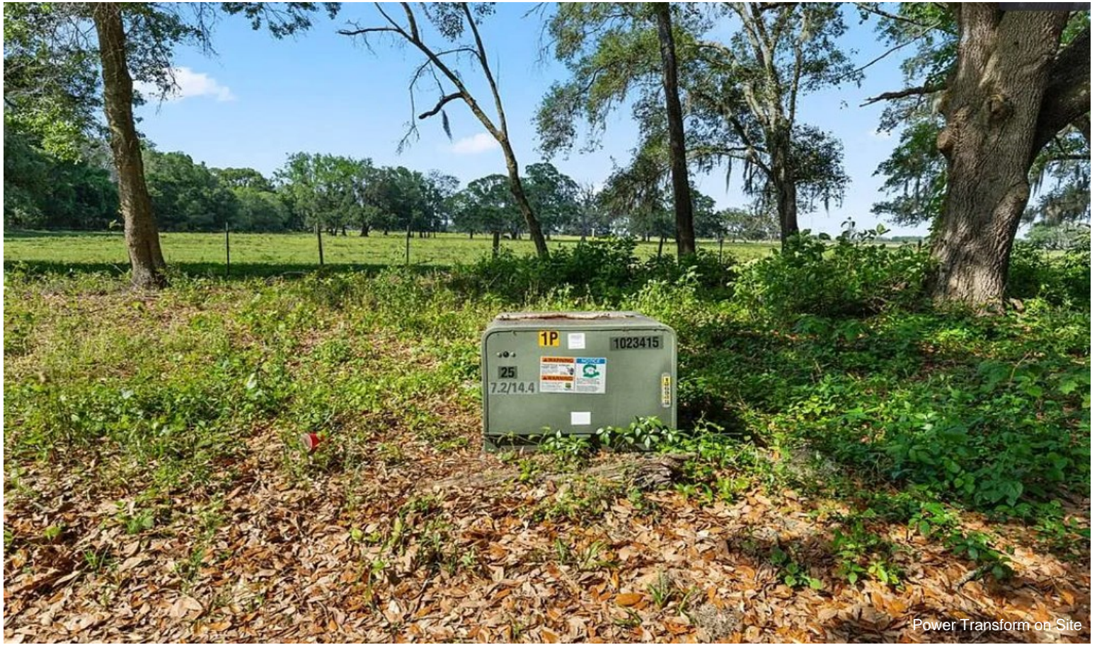
Power Transform on Site