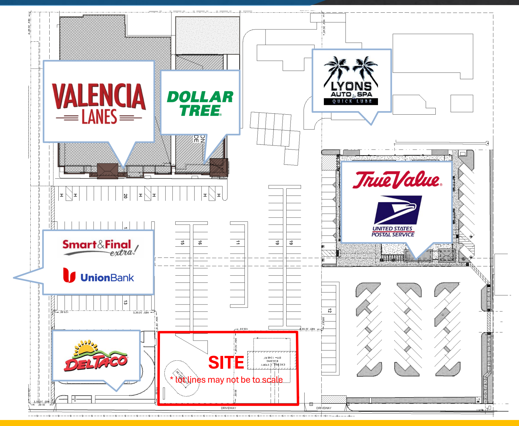
Lyons Avenue: +/- 32,293 Cars Per Day