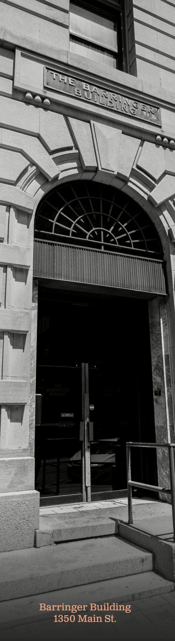
Barringer Building 1350 Main St.