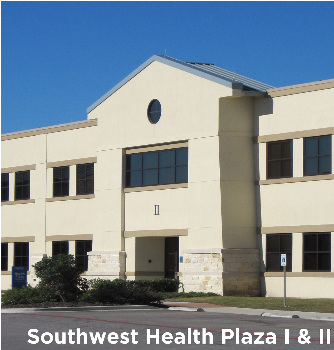
Southwest Health Plaza I & II