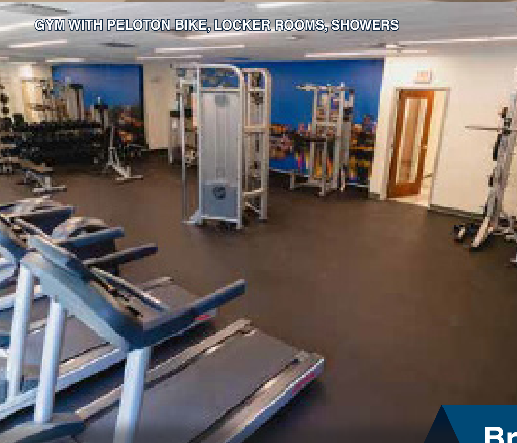
GYM WITH PELOTON BIKE, LOCKER ROOMS, SHOWERS