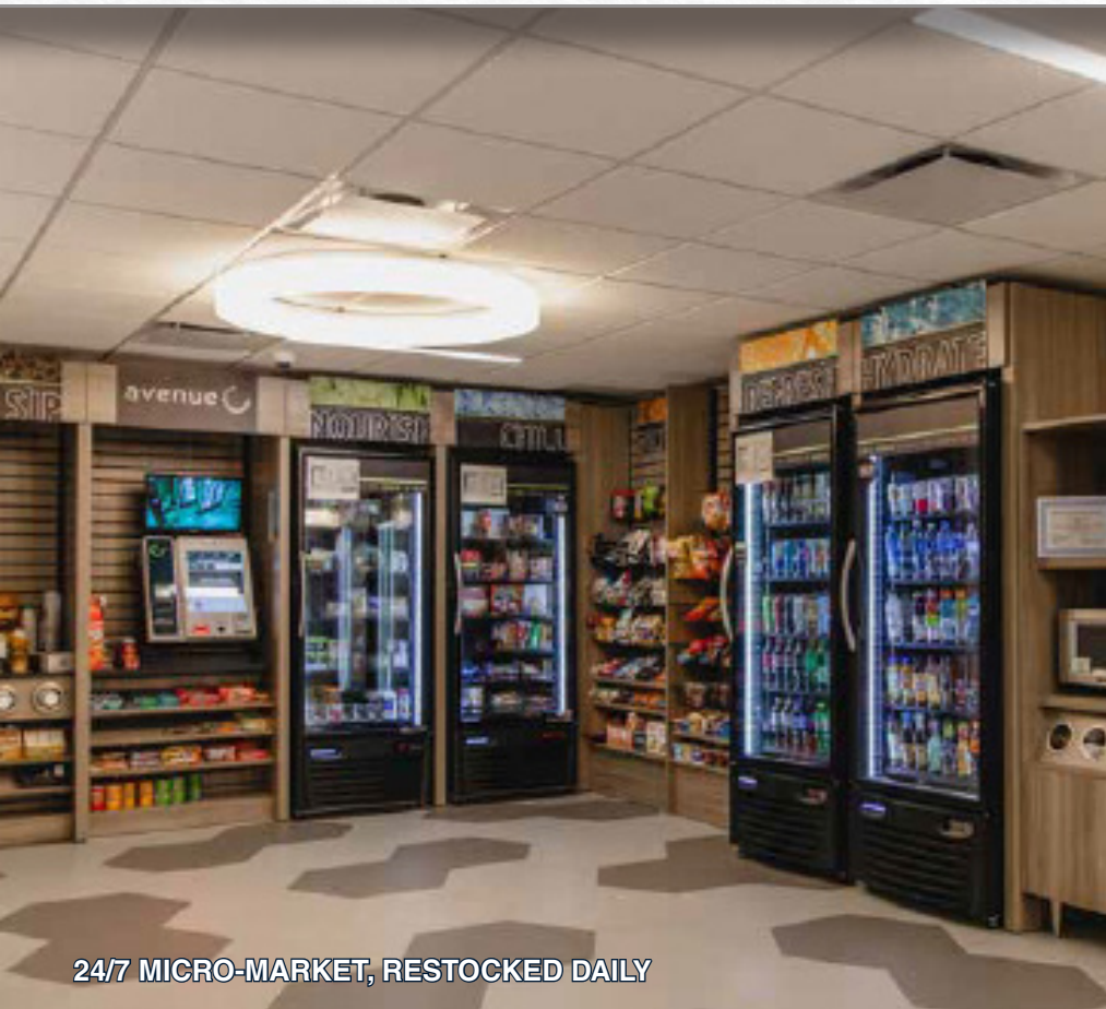
24/7 MICRO-MARKET, RESTOCKED DAILY