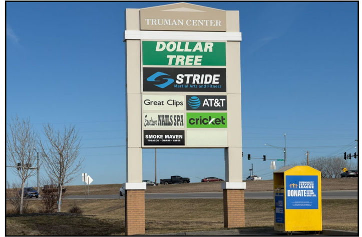
Suite B - 1,500 SF Former AT&T Space