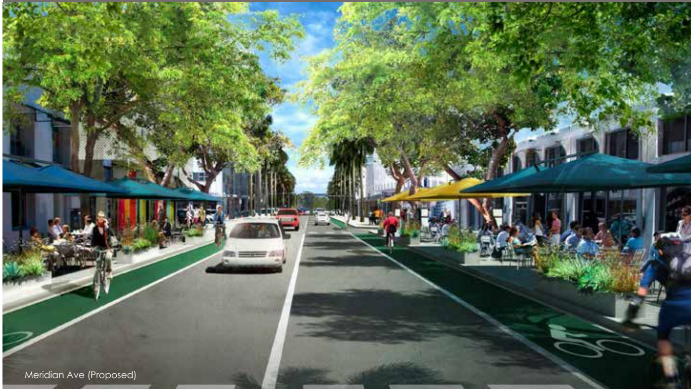
Meridian Ave (Proposed)