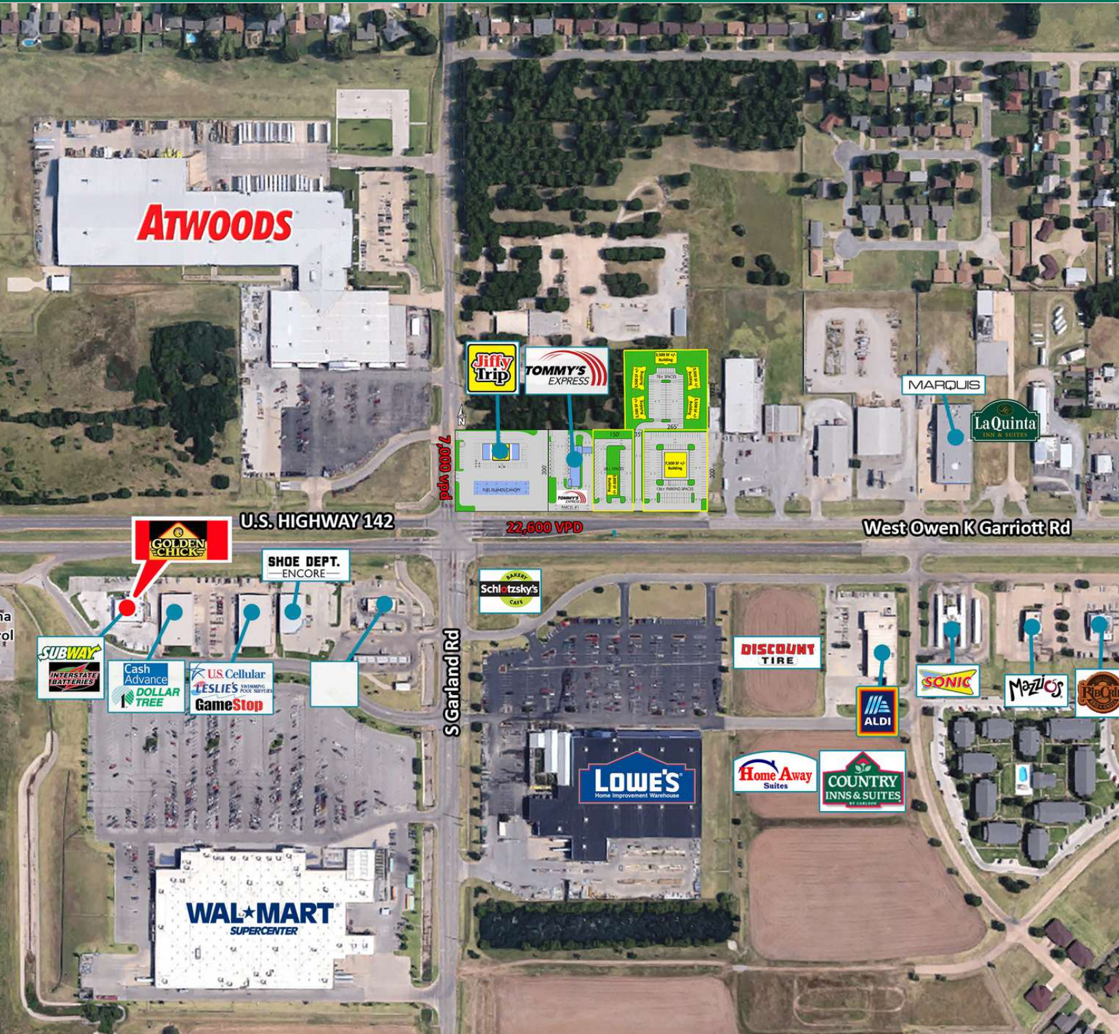
Former Golden Chick space is available in this 3 Tenant Building