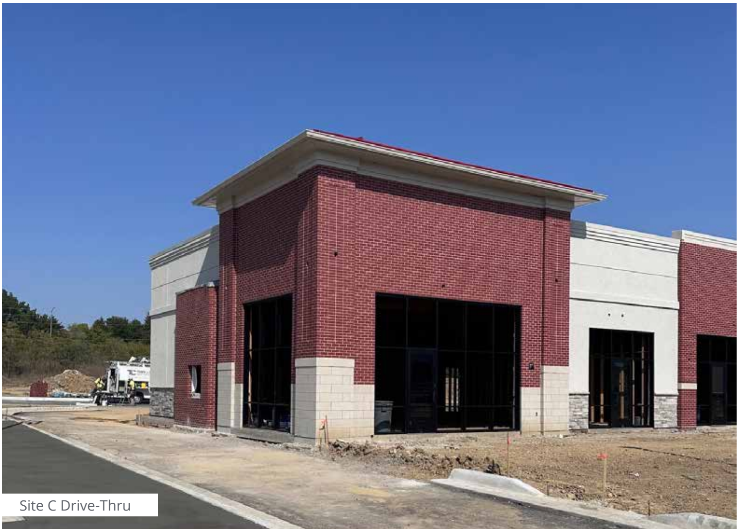
Site C Drive-Thru