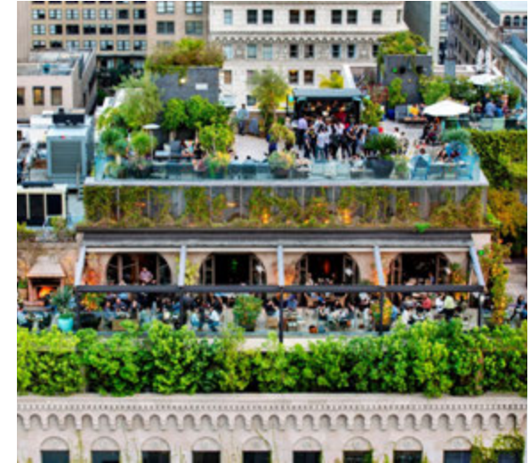
📍 PERCH LOS ANGELES