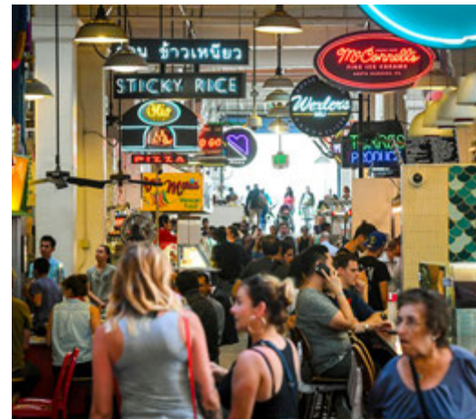
📍 GRAND CENTRAL MARKET