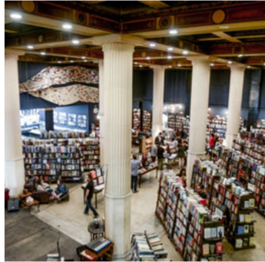
📍 LAST BOOKSTORE