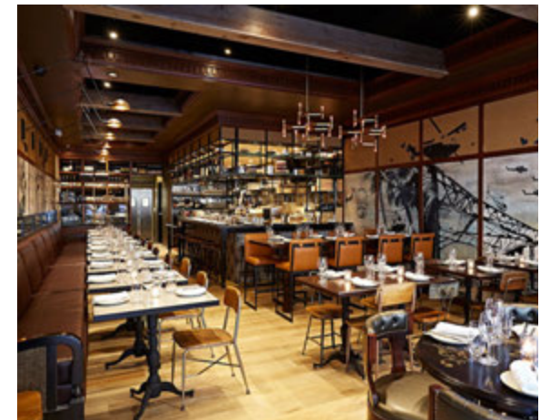
📍 LITTLE SISTER