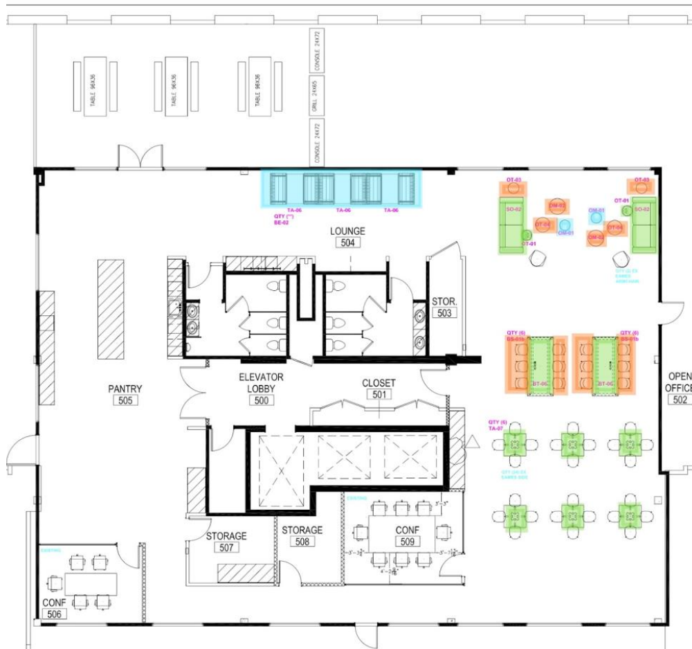
±5,744 SF - Shows Hypothetical Furniture Layout