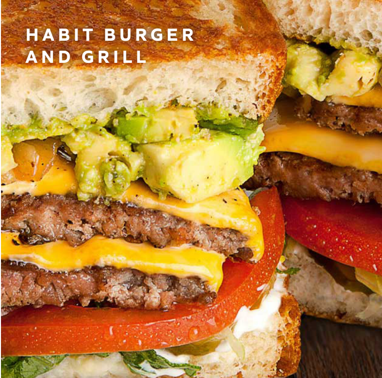
HABIT BURGER AND GRILL