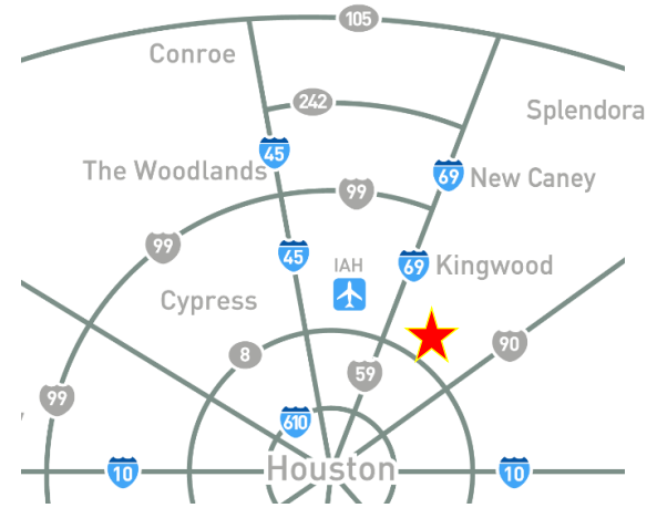
Demographics (5 Mile Radius)