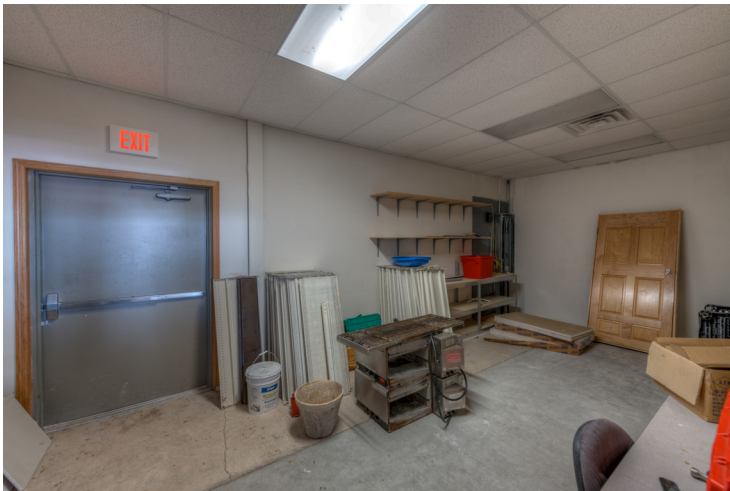
Storage room with wide door to back parking lot