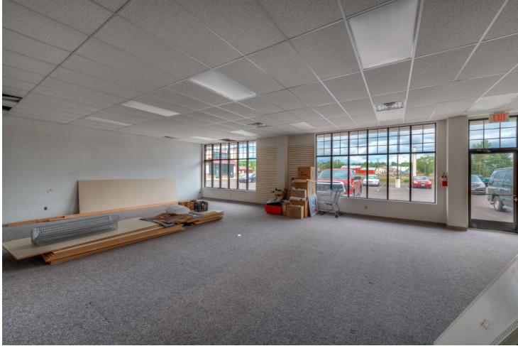
Plenty of natural light and storefront presence

Retail or Potential Office Space - 1,700 SF - Initial estimated monthly rent of $1,963