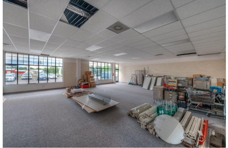
Preexisting shelf walls