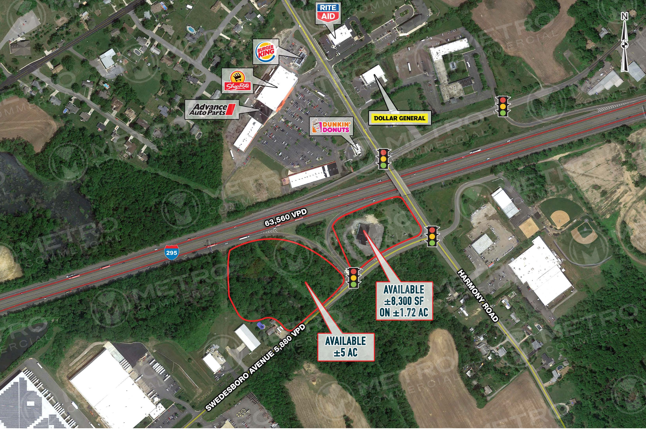
The information and images contained herein are from sources deemed reliable. However, Metro Commercial Real Estate, Inc. makes no representation whatsoever as to their accuracy or authenticity. Images shown may be modified for illustrative purposes. Images may be out-of-date and not current. 8.14.1