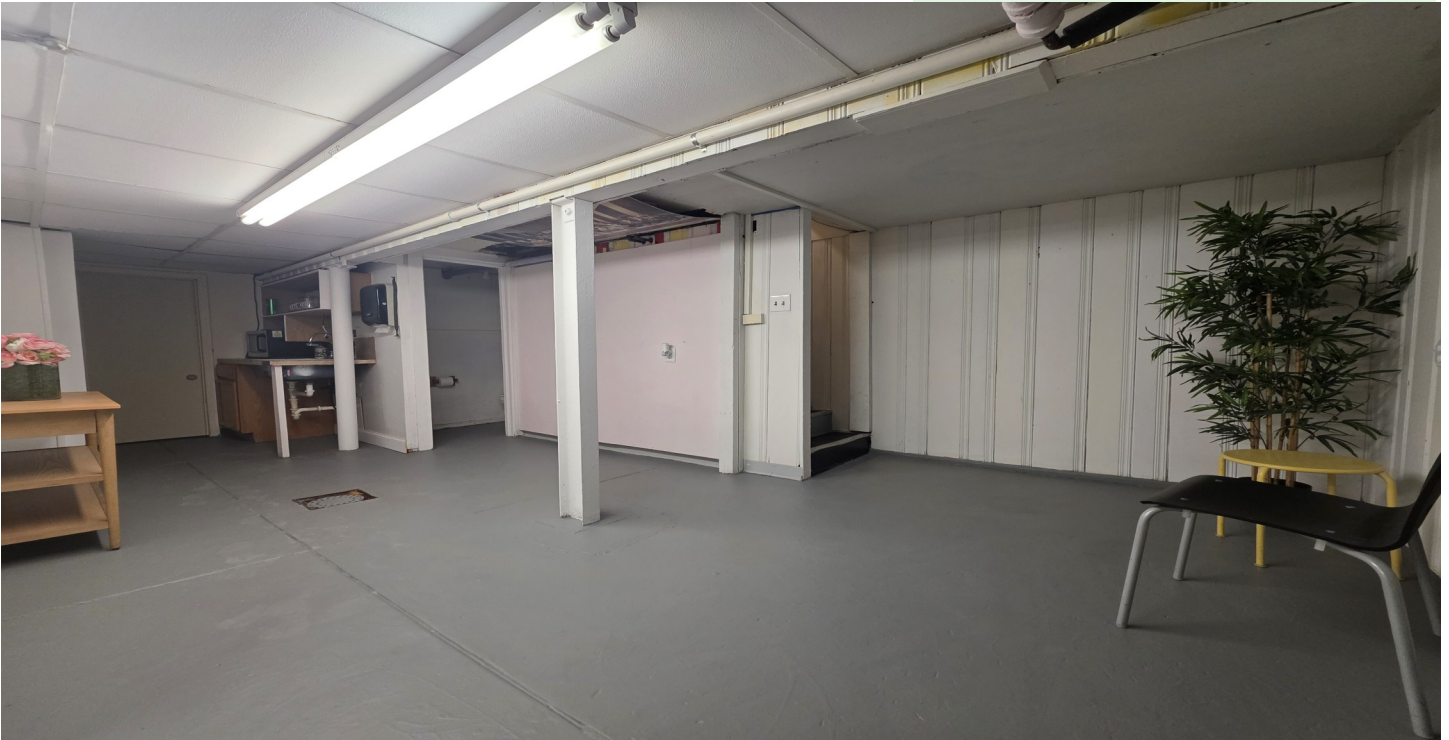
Basement Common Area