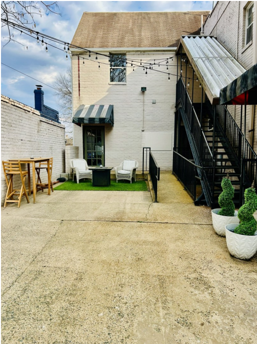
Courtyard entrance to Suite C