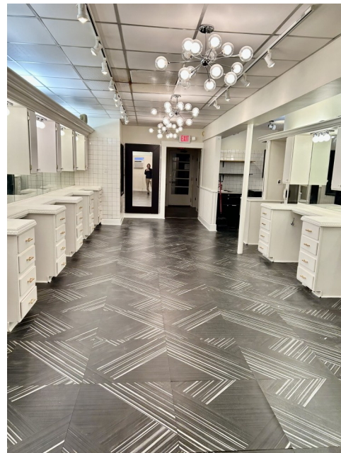
Suite C—large room