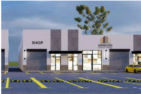
Transforming the garage Into a sleek glass facade.