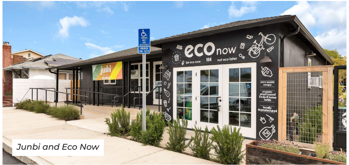
Junbi and Eco Now