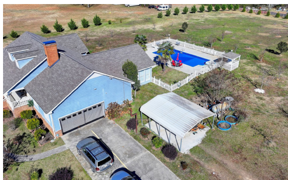
Back Yard View-Garage