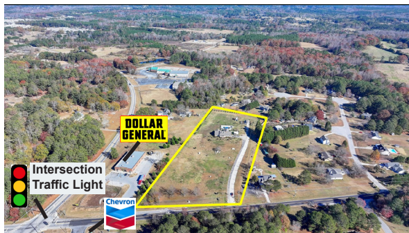
5.25 Acres Property Line

3615 Miller Bottom Rd., Loganville, GA 30052-3020, Walton County