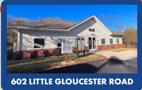
602 LITTLE GLOUCESTER ROAD