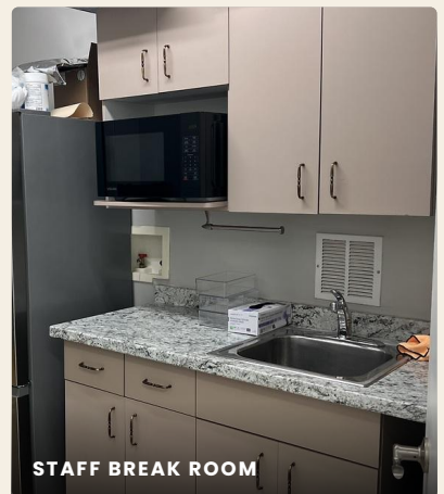
STAFF BREAK ROOM

Existing reception, multiple exam/treatment rooms, private office, break room & ADA restroom — plug-and-play for a healthcare tenant.