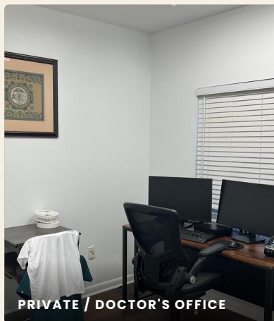
PRIVATE / DOCTOR'S OFFICE