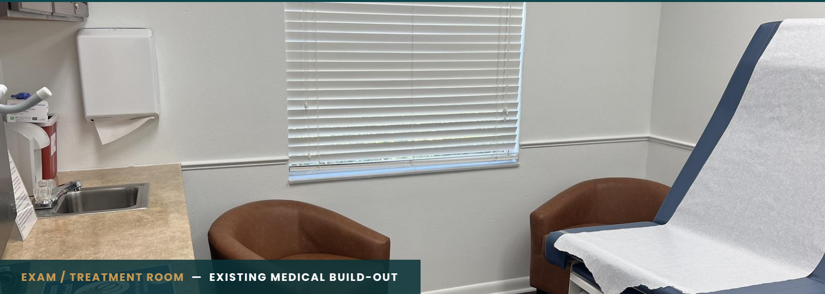
EXAM / TREATMENT ROOM — EXISTING MEDICAL BUILD-OUT