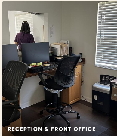
RECEPTION & FRONT OFFICE