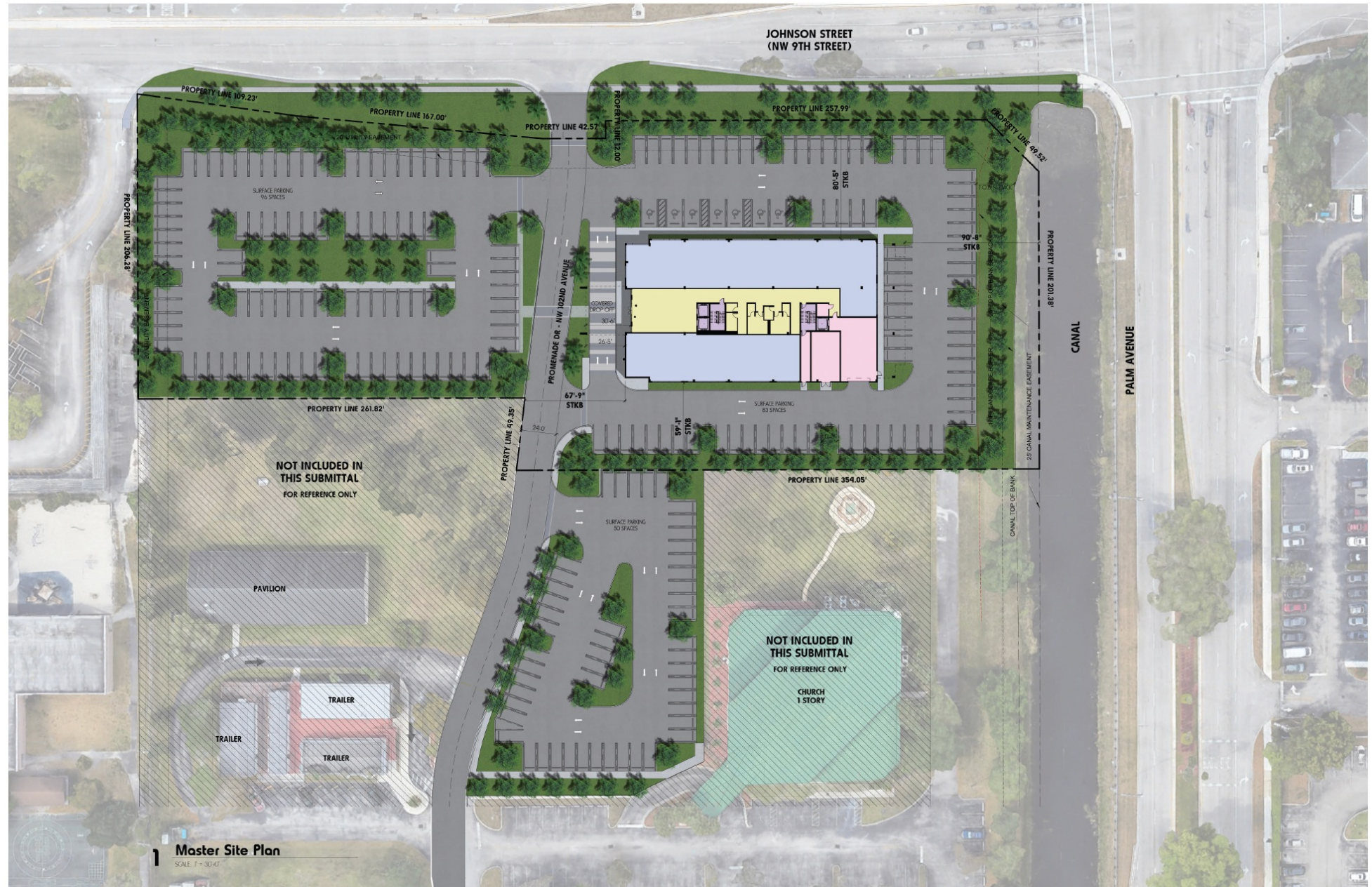
Master Site Plan SCALE: 1" = 30'-0"