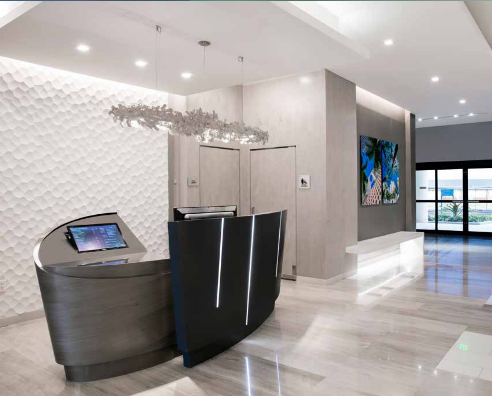
RECEPTION | TOUCH SCREEN DIRECTORY