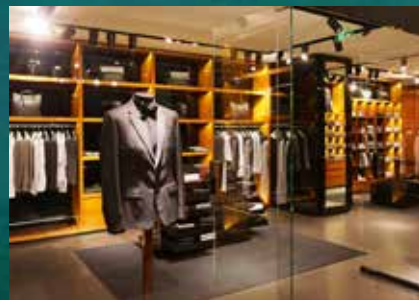
BAL HARBOR SHOPS