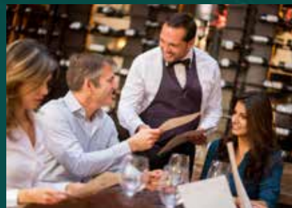
LAS OLAS BOULEVARD