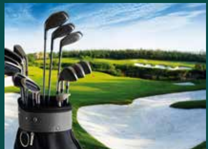
TURNBERRY ISLE GOLF COURSE