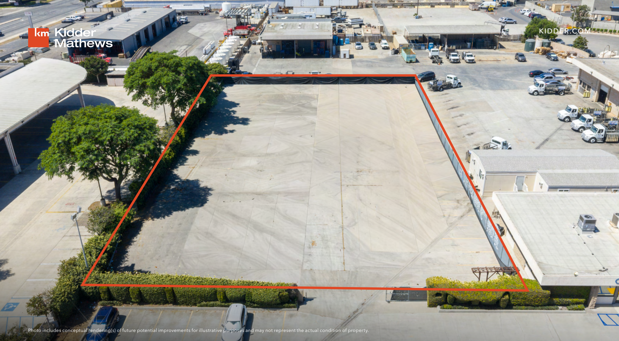
Photo includes conceptual rendering(s) of future potential improvements for illustrative purposes and may not represent the actual condition of property.