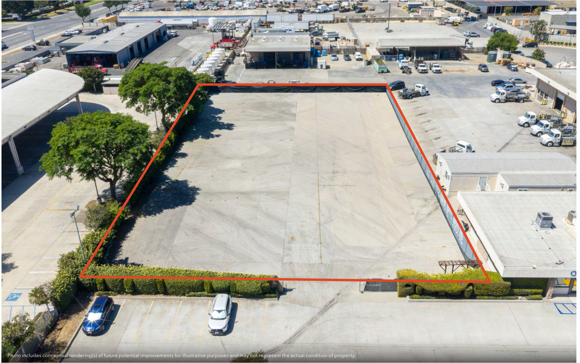
Photo includes conceptual rendering(s) of future potential improvements for illustrative purposes and may not represent the actual condition of property.