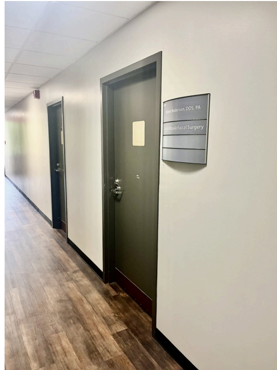
Well lit, wide hallways