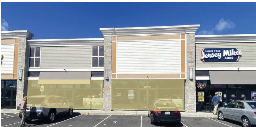
AVAILABLE UNITS A & B