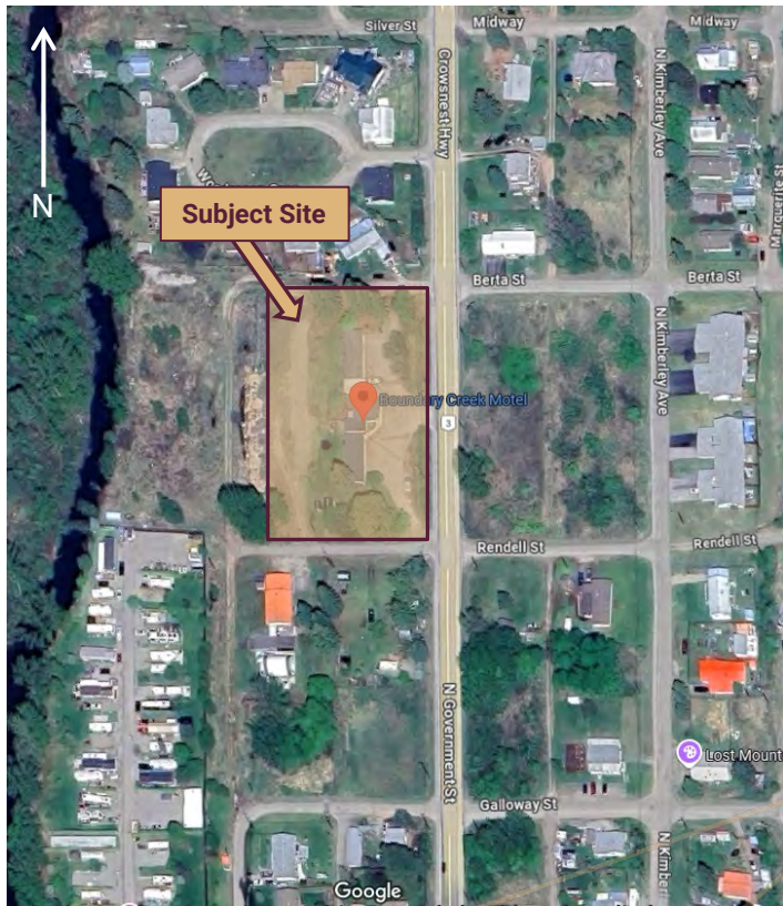
Shape of property is approximate and should not be relied upon

Grand Forks – 40 kms – 28 mins US Border Midway – 14kms – 12 mins Osoyoos – 85 kms – 1 hr Vancouver – 482 kms – 5.75 hours Calgary – 750 kms – 8.25 hrs