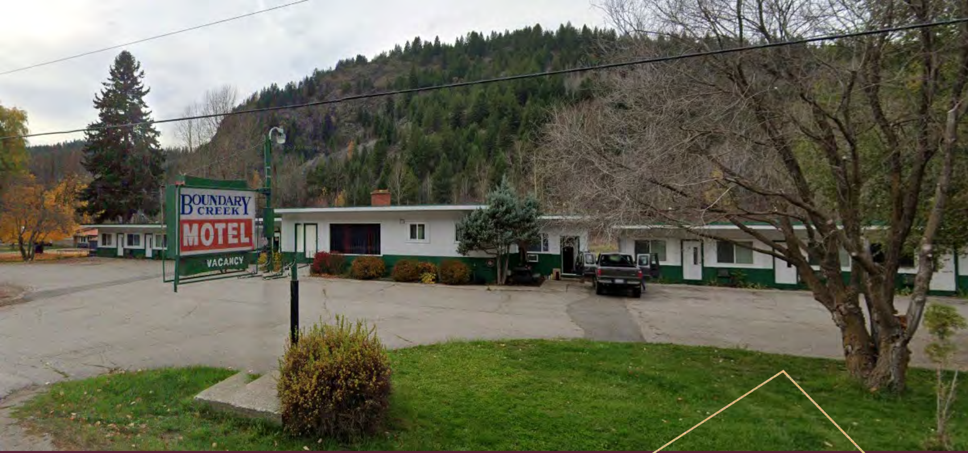
Boundary Creek Motel, Greenwood, BC