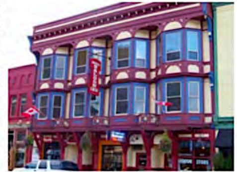
an impressive scale model and panoramic photo.

The smelter prospered for a decade, until copper prices plummeted and caused it to operate only sporadically. In 1918, the plant shut down for good. Its lifeblood gone, the once booming city shrank to only 200 inhabitants. Despite the population implosion, Greenwood maintained its city council, and thereby its city status.