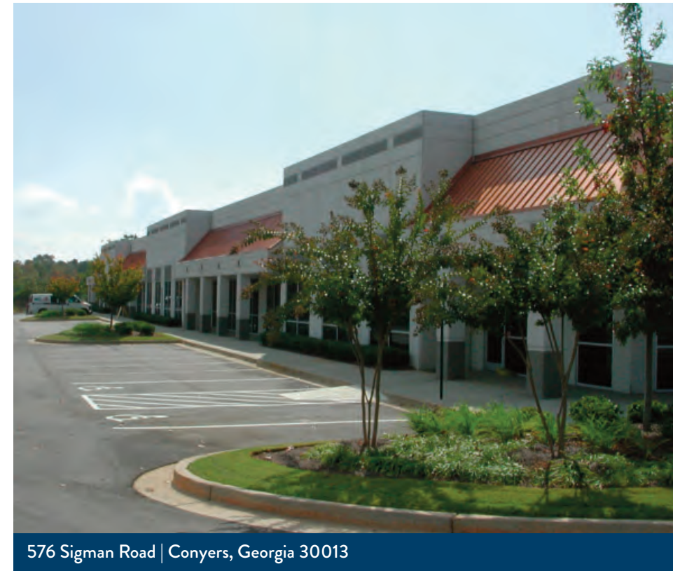
576 Sigman Road | Conyers, Georgia 30013