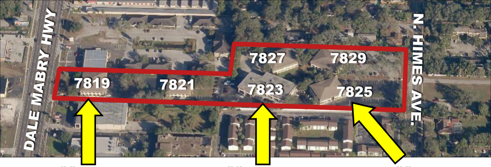
Building 7819 Closest Building to Dale Mabry Hwy; Suite available 722 SF