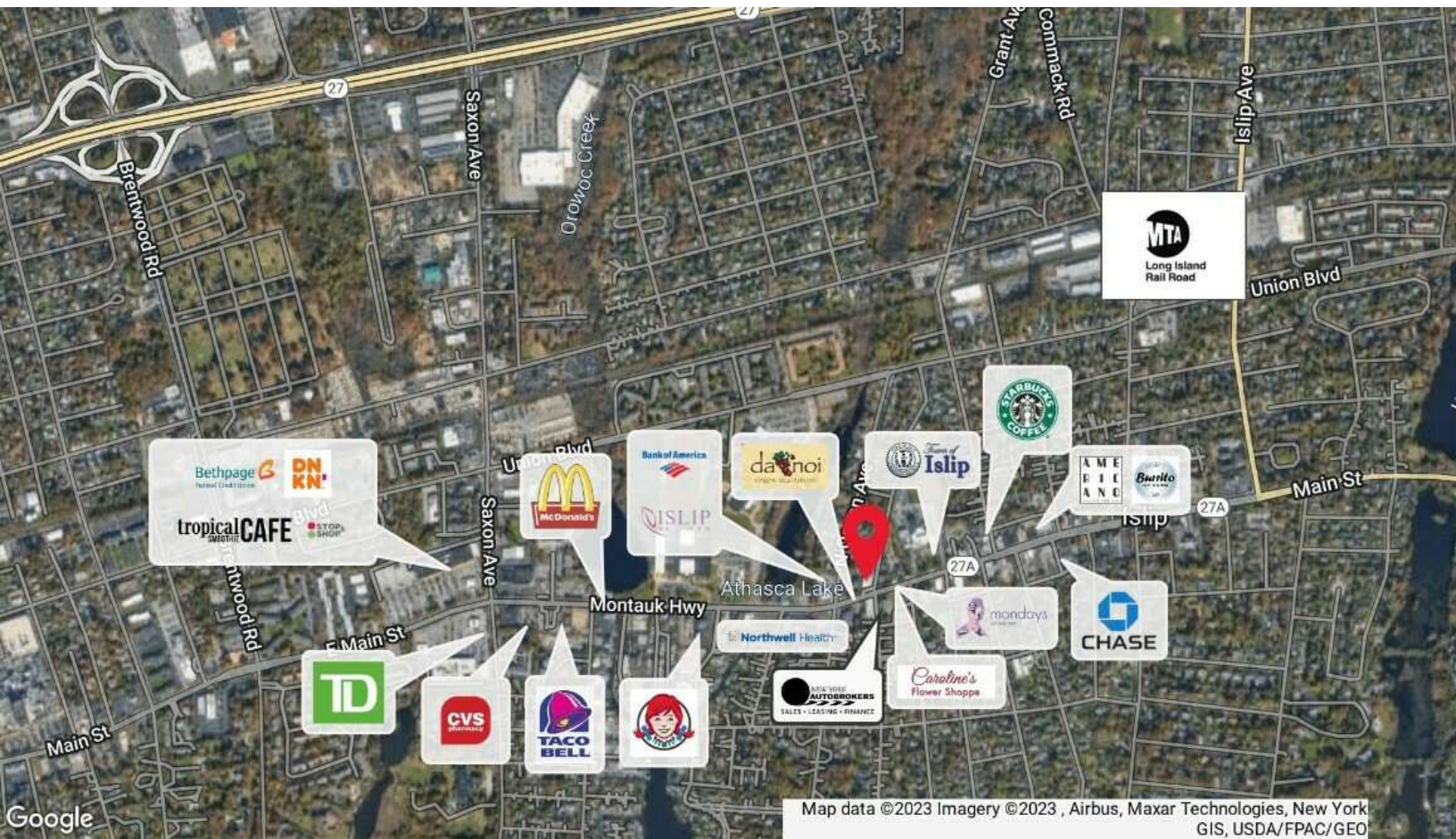
Map data ©2023 Imagery ©2023 , Airbus, Maxar Technologies, New York GIS, USDA/FPAC/GEO