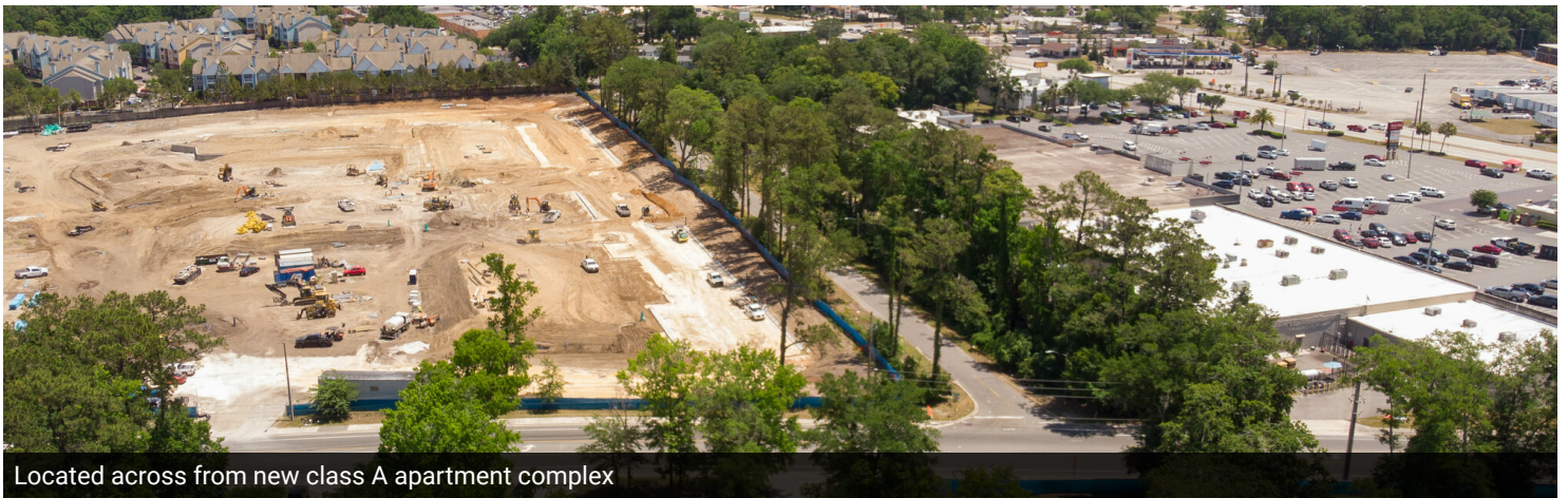
Located across from new class A apartment complex