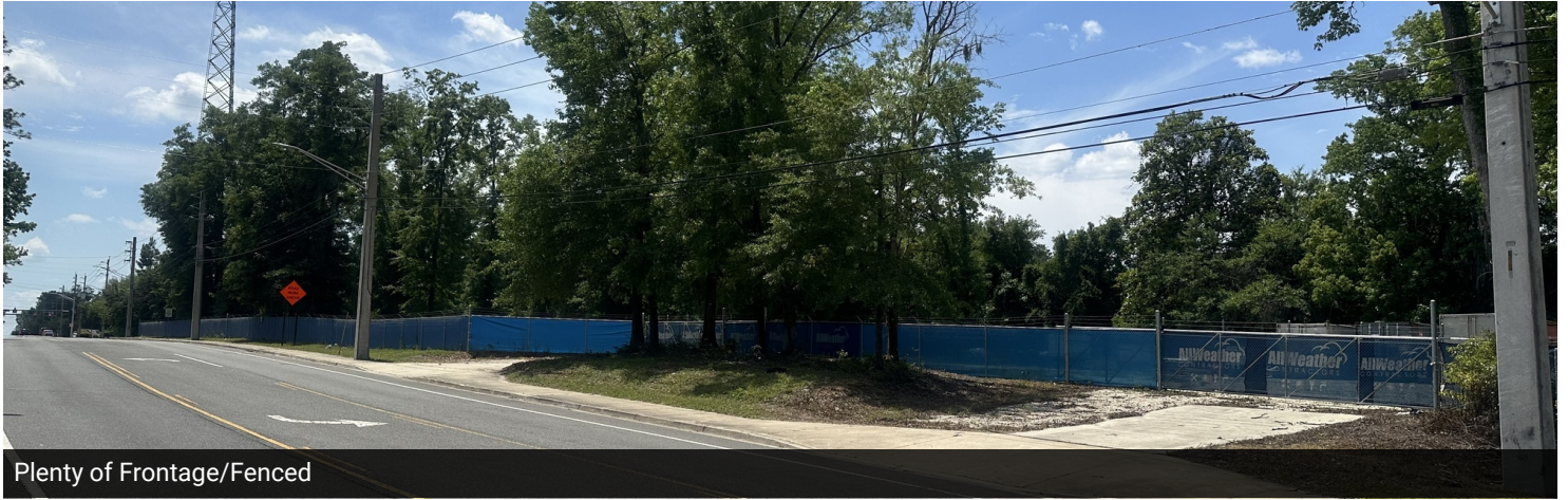
Plenty of Frontage/Fenced

1508 FOURAKER RD, JACKSONVILLE, FL 32221