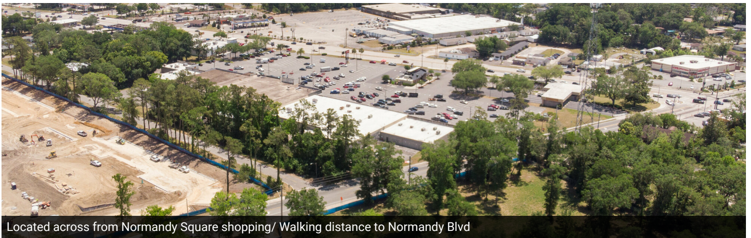
Located across from Normandy Square shopping/ Walking distance to Normandy Blvd