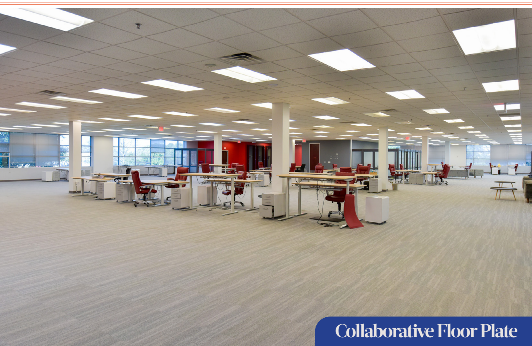
Collaborative Floor Plate