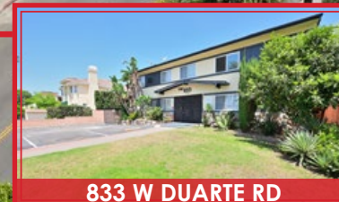
833 W DUARTE RD

Most errands can be accomplished on foot.