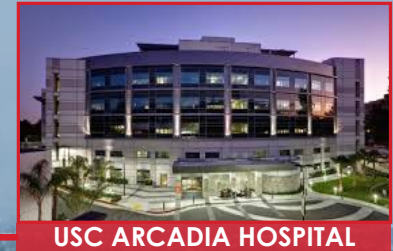
USC ARCADIA HOSPITAL