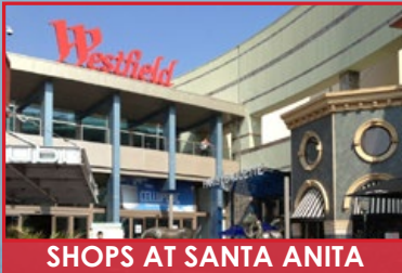
SHOPS AT SANTA ANITA