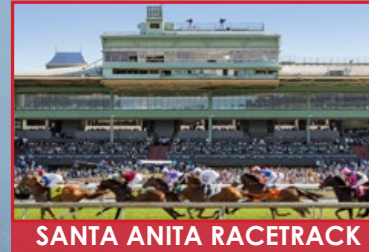
SANTA ANITA RACETRACK