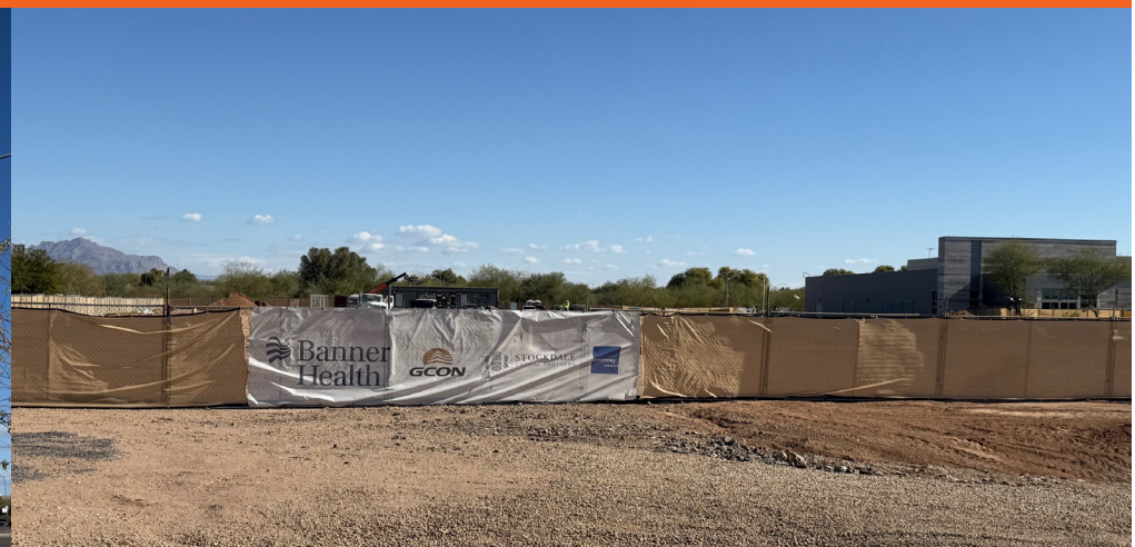
BANNER HEALTH - Phase II expansion of successful Banner Medical Center currently under construction.