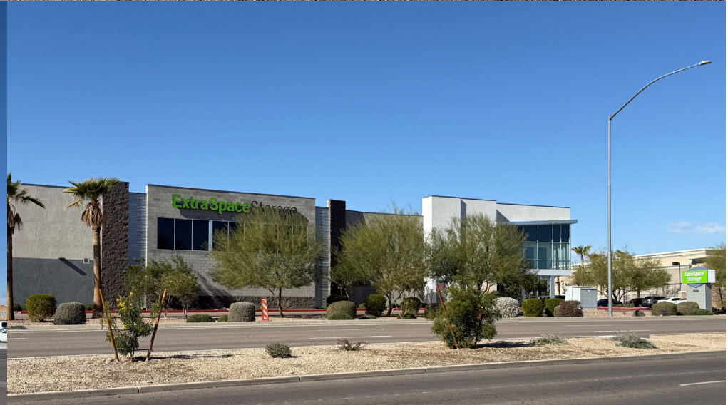
EXTRA SPACE STORAGE - Recently opened self storage center.