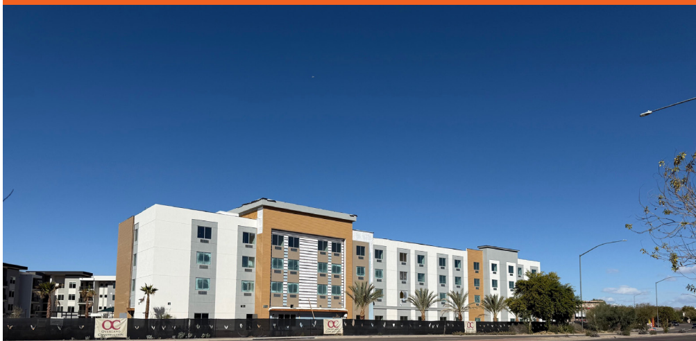
ATWELL SUITES - A new upper-midscale, all-suites hotel brand that brings inspiration to every journey. Opens 2025.