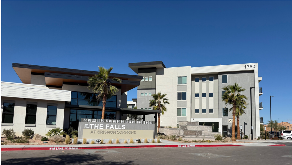
FALLS AT CRISMON COMMONS - 240 multifamily units opening in 2025. Phase II starts construction soon.