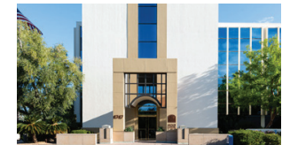
4747 4747 N 22nd St Phoenix, AZ 85016