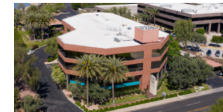
7250 7250 N 16th St Phoenix, AZ 85020