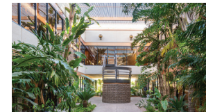
Alma School 1745 & 1811 S Alma School Rd Mesa, AZ 85210