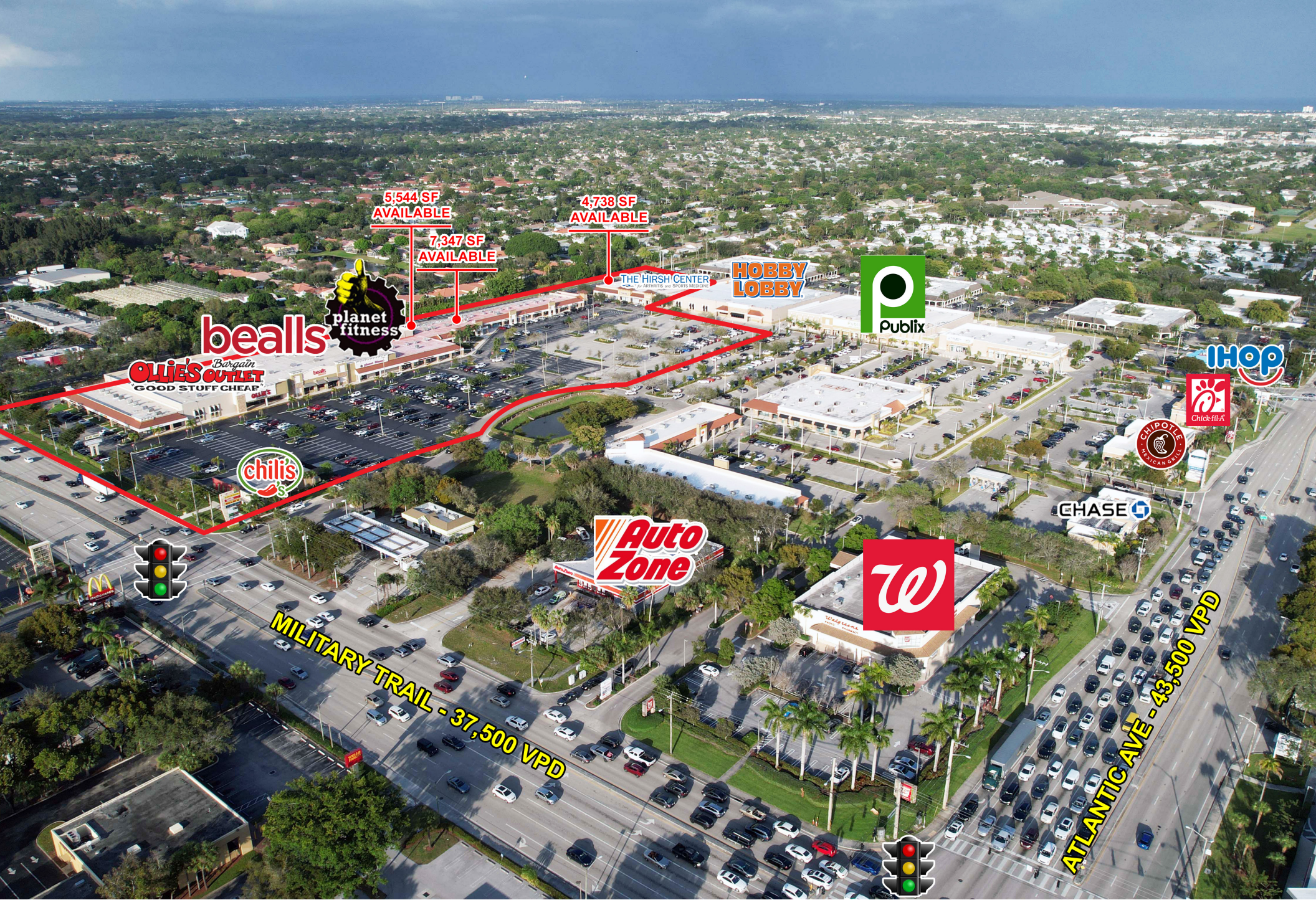
DELRAY SQUARE II | CENTER AERIAL